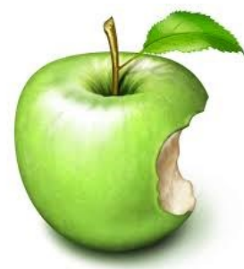
1 Timothy 6:18

Welcome all of you who are guests with us today. Our desire is for you to relax and be blessed by worship, God's Word, and fellowship. We, the members, have committed ourselves to underwrite the church financially. We do not expect you to contribute to the offering, but you are free to participate. We would like to get to know you and for you to know us better.