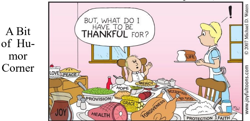
Praise the LORD, O my soul, and forget not all his benefits-- PSALM 103:2 NIV