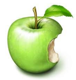
1 Timothy 6:18

Welcome all of you who are guests with us today. Our desire is for you to relax and be blessed by worship, God's Word, and fellowship. We, the members, have committed ourselves to underwrite the church financially. We do not expect you to contribute to the offering, but you are free to participate. We would like to get to know you and for you to know us better.